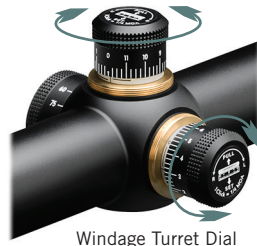
Windage Turret Dial