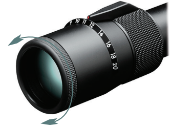
Adjust the reticle focus

TIP: Try to make this particular adjustment quickly as your eye will try to compensate for an out-of-focus reticle.